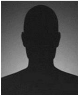
Male juvenile, 17